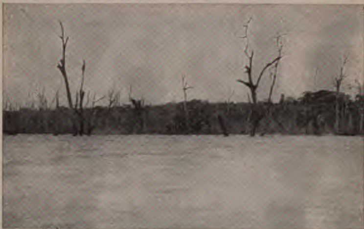
The edge of the drowning forest